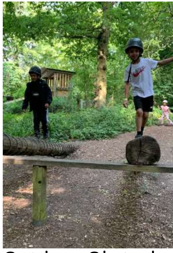
Outdoor Obstacle Course