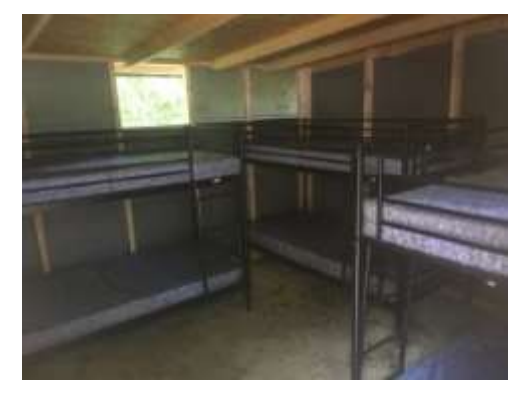
Inside the permanent tent