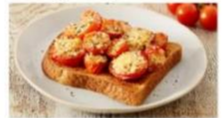
Baked tomatoes on toast

Cook a healthy meal. Use: https://www.nhs.uk/change4life/recipes/lunch for recipe ideas.